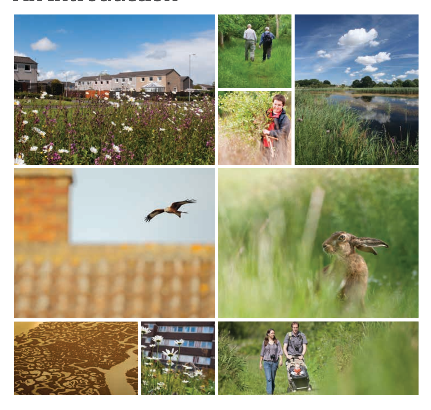
"The Nature and Wellbeing Act is a proposal for a new law in England to restore nature and improve our quality of life"